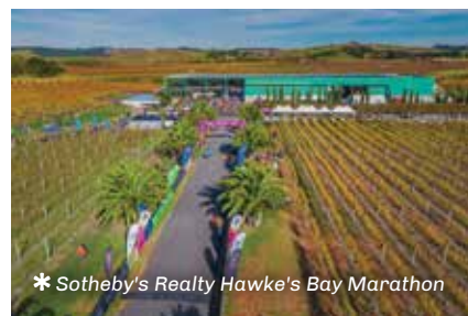
* Sotheby's Realty Hawke's Bay Marathon