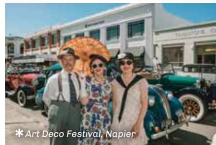
* Art Deco Festival, Napier