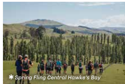
* Spring Fling Central Hawke's Bay