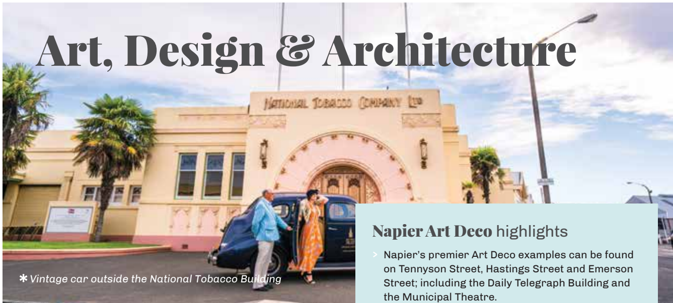
* Vintage car outside the National Tobacco Building

With creative culture fed by good food and great wine, Hawke's Bay is home to many of New Zealand's best-known artists, photographers, furniture and fashion designers, musicians, and filmmakers.