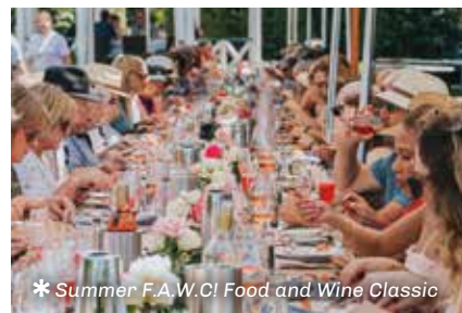
* Summer F.A.W.C! Food and Wine Classic