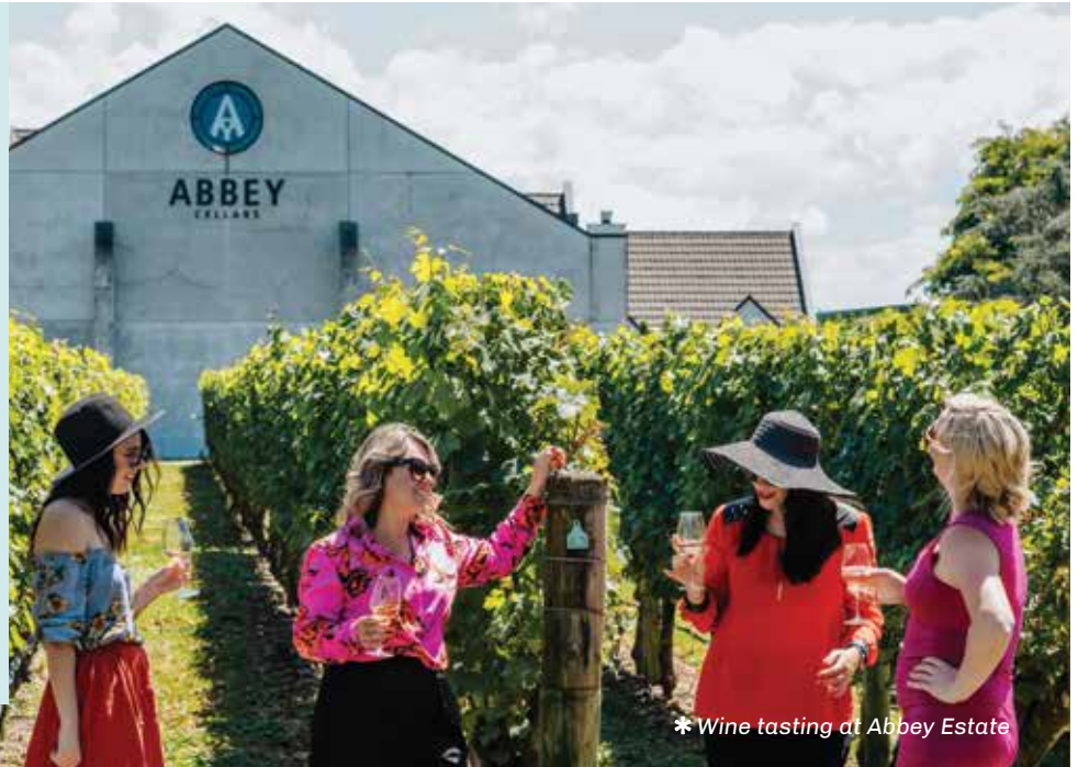
* Wine tasting at Abbey Estate